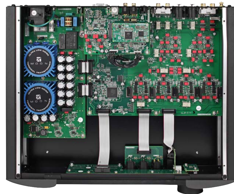
Twin toroidal transformers give the Moon Neo power to drive even the most insensitive of headphones.

2s and listening to the San Francisco Symphony's recording of Jongen's 'Symphonie Concertante' on CD via the analogue inputs and the low organ notes reverberated in my head. The PM-2s have a slightly warm sound to them but the Neo seemed to grip them so tightly it brought out masses of detail.