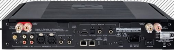
ABOVE: Single 4mm speaker binding posts and preamp outputs (on RCAs) are joined by MM/MC phono and two line ins (one balanced on XLR). Streaming is offered via wired Ethernet (x2) and wireless with digital ins on optical, two coaxial (to 192kHz), a USB-C host port for external drives (to 384kHz and DSD256) and HDMI ARC (48kHz)

the sound leaping forward to almost touch the listening seat, every transient detail leaned into with gusto. By comparison, her twee breakout hit 'Nine Million Bicycles' took on a sweeter, more flowing feel, without the amp veering into honeyed, softly-softly territory.