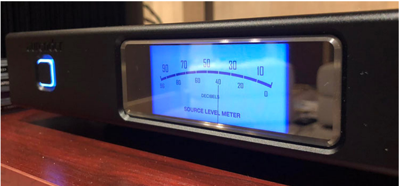
Network Music Server AMOLED Screen

This is the part of the A10 that gets rocky, the unit is finished nicely and weighs in at just over 20lbs. My biggest gripe concerns the four buttons on the front. It is almost impossible to make out their purpose. Since this unit is best controlled with an app and includes a remote, it made me wonder why they were even included in the first place, the faceplate would have looked so much cleaner without them. Now for the coolest feature; in the app, you can change the AMOLED display on the front to show a track list or a cool looking McIntosh-like meter. I loved its clean style, it was almost lifelike thanks to the AMOLED technology behind the screen. On the back of the unit we have the standard balanced and unbalanced analog outputs along with optical and USB inputs and an Ethernet port.