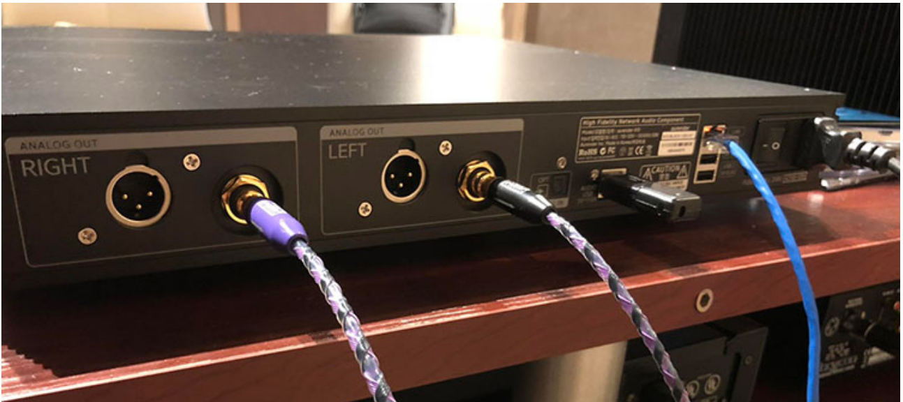
Aurender A10 Network Music Server Inputs