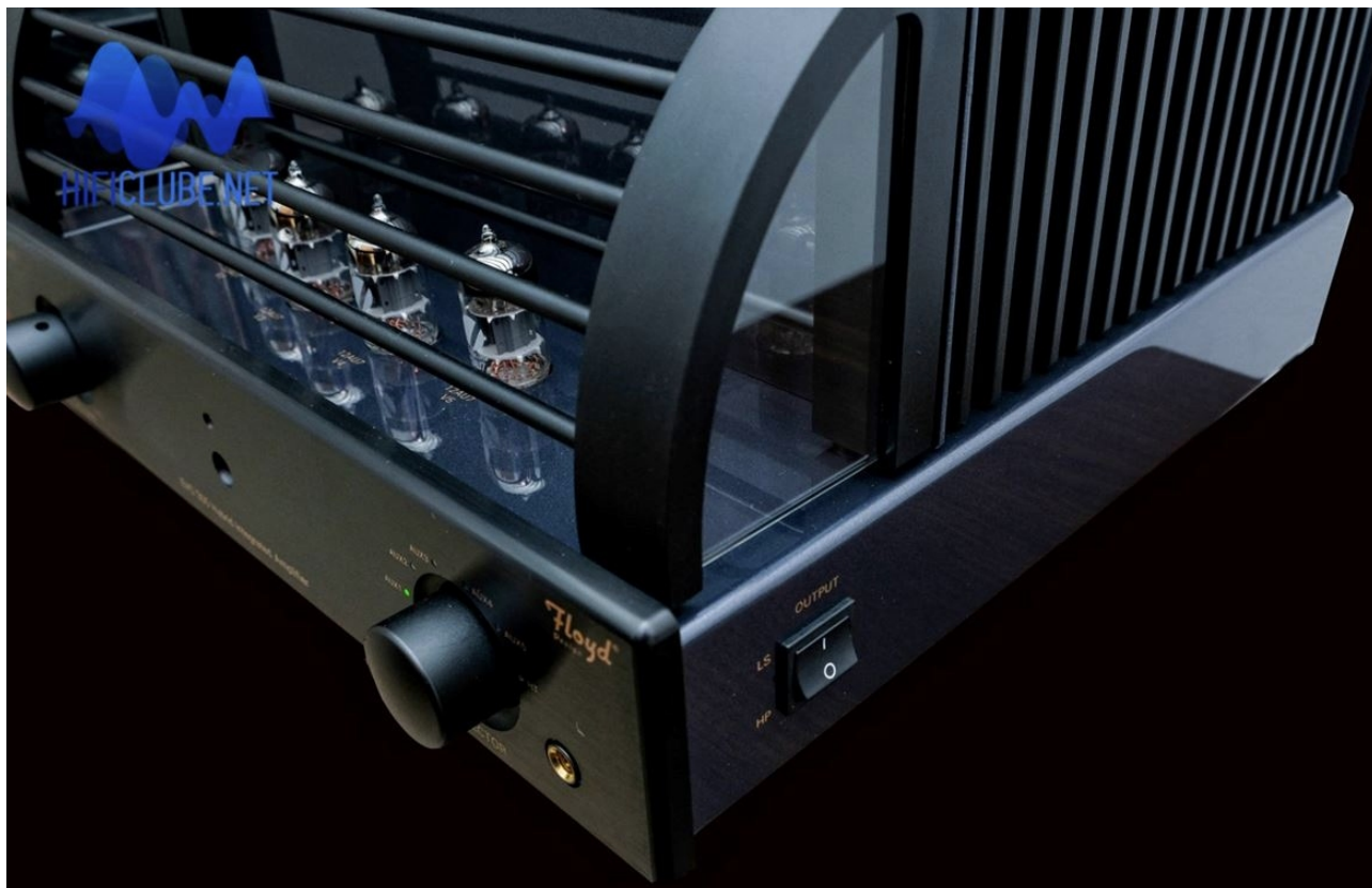
PrimaLuna EVO3 00 Hybrid - You can find the switch for the headphone output on the right side. The power does not switch by simply inserting the headphone jack.

Outputs for Tape Out and Subwoofer Out (mono or stereo) and LS/HP (headphones), with a switch mounted on the right-hand side of the box and On/Off on the left-hand side, both seen from the front.