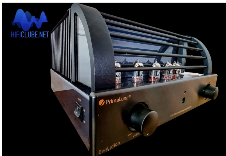
PrimaLuna EVO 300 Hybrid - on the left side is the On/Off switch