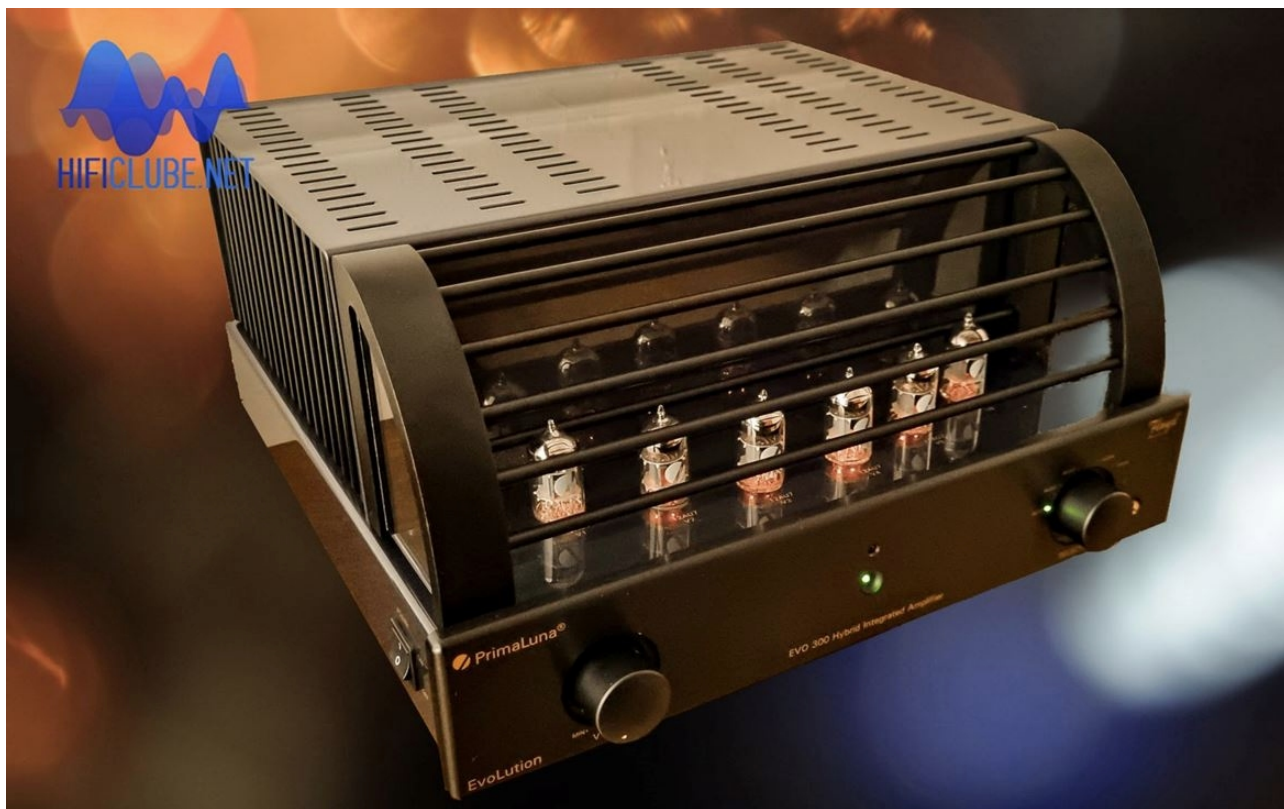
PrimaLuna EVO 300 Hybrid - the unmistakable PrimaLuna design, but now with a MOSFET power stage.

Although designed in The Netherlands, the PrimaLuna amplifiers are built in China, making them affordable by audiophile standards. A market where amplifiers of similar features and less robust construction can cost tens of thousands of Euros.