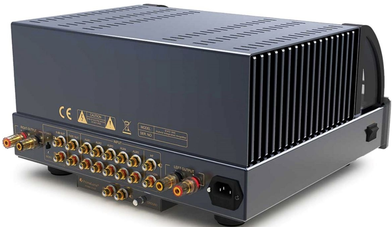
PrimaLuna EVO300 Hybrid - rear panel: note the Phono box for the optional (and additional) PhonoLogue stage mounted under the chassis.

All this to partly justify the high price, by PrimaLuna standards, of €7,150.00, as if the sound quality wasn't already enough.